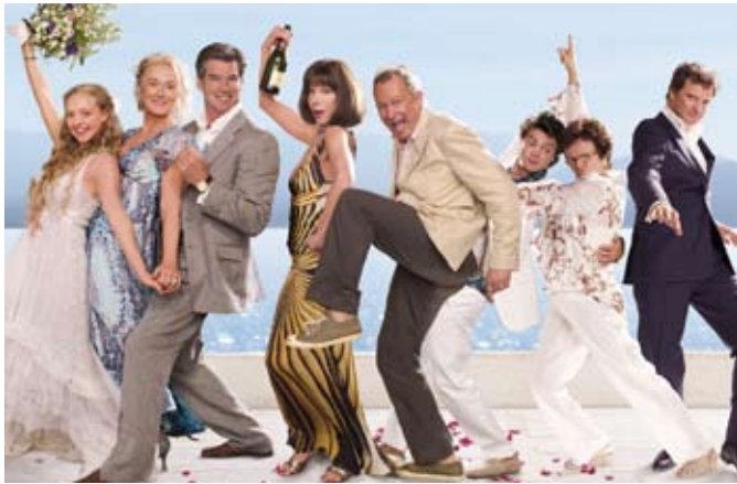
The Mamma Mia! cast celebrate their poll victory