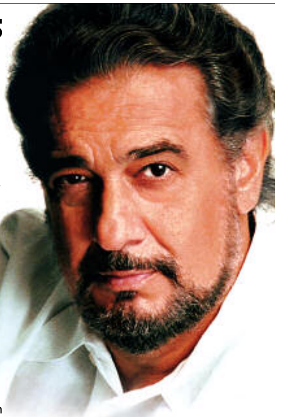
On screen this autumn: Domingo