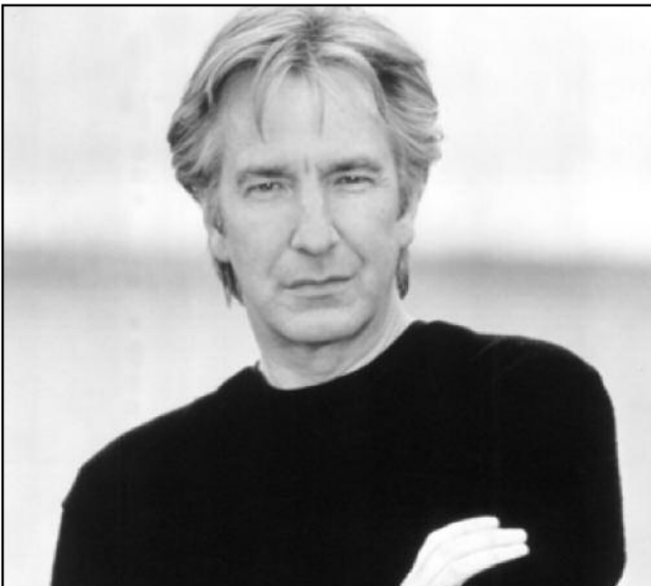
Curzon patron Alan Rickman launched the Raise the Roof campaign in 2006

If you are able to make a regular donation, please visit www.curzon.org.uk/raisetherooft.html and download the Tile Covenant form.