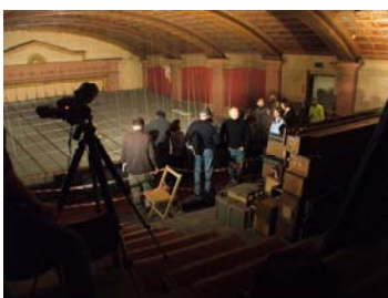
Visitors taking a guided tour at last year's Open Day