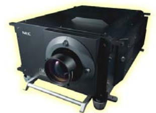
The Curzon's new NEC digital projector