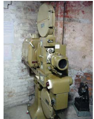
A Kalee 19 35mm projector, part of the Curzon Collection.